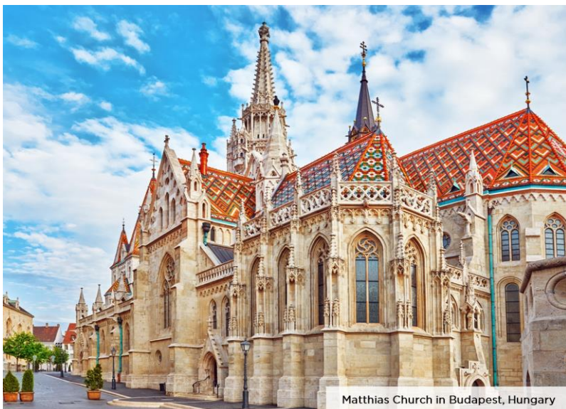
Matthias Church in Budapest, Hungary

Optional Land Packages Pre-cruise 2 Nights Budapest from $610 per person