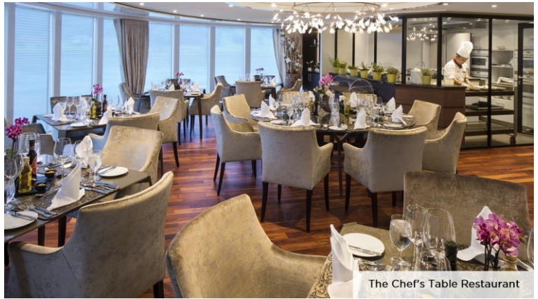
The Chef's Table Restaurant